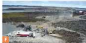
F MEADOWBANK NUNAVUT, CANADA