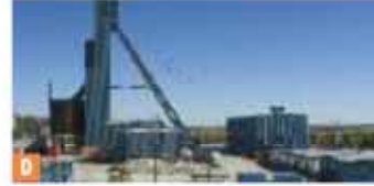
D LAPA QUEBEC, CANADA