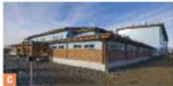
C KITTLA KITTLA, FINLAND