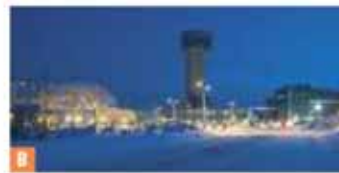
B GOLDEX QUEBEC, CANADA