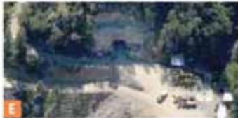
E PINOS ALTOS CHIHUAHUA, MEXICO