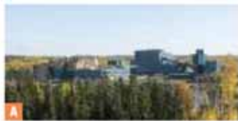
A LaRONDE QUEBEC, CANADA